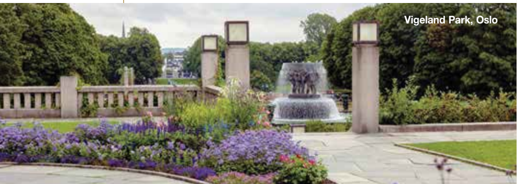
Vigeland Park, Oslo