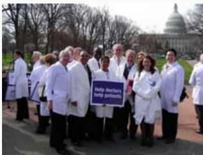
MSMS leaders outside the Capitol in 2008.

While Congress continues its summer recess, MSMS continues efforts to push for repeal of the failing